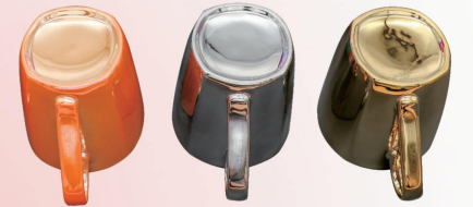
Ceramic ware 陶瓷日用品: Amber琥珀色/Silver银色/Gold金色