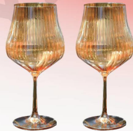
Transparent Gold 透明金色