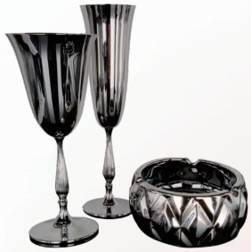
Mirror Silver 银色