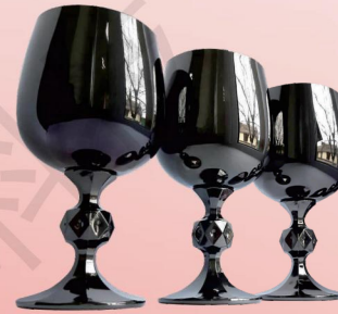
Mirror Black 镜面黑色