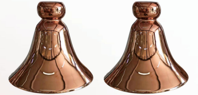
Rose Gold 玫瑰金