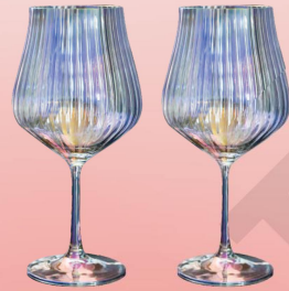
Transparent Rainbow 透明彩色