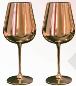
Mirror Gold 镜面金色