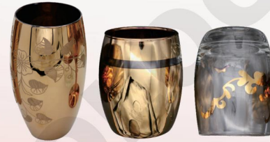
2-sides Gold 双面金色