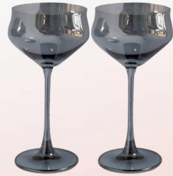
Transparent Silver 透明银色